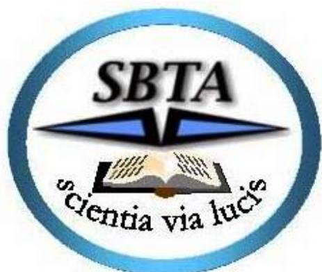
Figure 1 Brazilian Air Transportation Research Society Logo.

All figures and graphics inserted in the document must be JPEG, SVG, GIF, PNG or VSD (Microsoft Visio Documents) with at least 300 dpi resolution. They must be Arabically-numbered, centralized in the column and followed by the corresponding captions, as done with Figure 1, which is the logotype of the Brazilian Air Transportation Research Society (SBTA). All references to figures should be done using cross-references, available on all recent versions of Microsoft Word and other processors, and should only contain the label “Figure” and its number in the document.